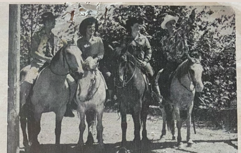
With his young people . . . .