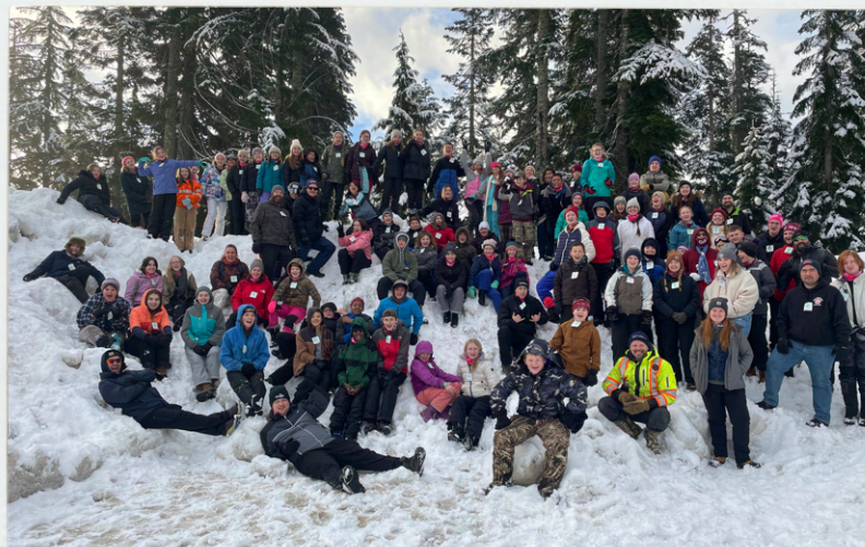
SNOWBLAST JANUARY 2023

What an amazing weekend of snow, fun with friends and times of teaching & worship in chapels!