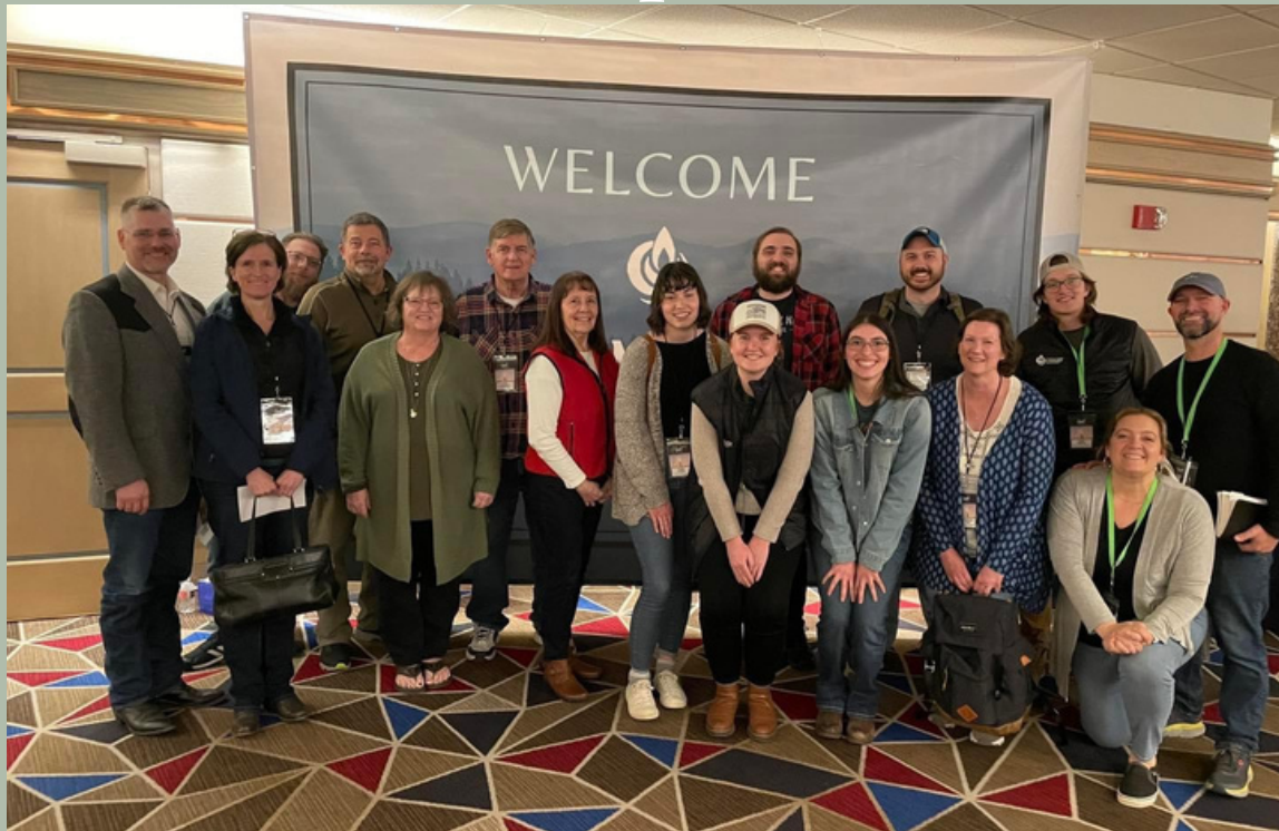
PICTURED FROM LEFT TO RIGHT